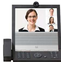
Cisco IP Video Phone E20 supports Cisco TelePresence MultiWay, which intuitively and instantly integrates multiple-party video calls.

The Cisco TelePresence™ portfolio creates an immersive, face-to-face experience over the network—empowering you to collaborate with others like never before. Through a powerful combination of technologies and design that allows you and remote participants to feel as if you are all in the same room, the Cisco TelePresence portfolio has the potential to provide great productivity benefits and transform your business. Many organizations are already using it to control costs, make decisions faster, improve customer intimacy, scale scarce resources, and speed products to market.