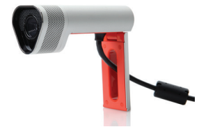
Polycom EagleEye Acoustic Camera