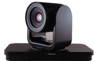
Polycom EagleEye IV 4x Camera (black)