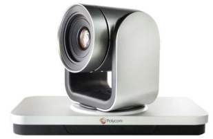
Polycom EagleEye IV 12x Camera (silver)

The Polycom EagleEye Acoustic camera is an optimal solution for a smaller environment. With built-in microphones and small footprint, this camera will easily blend into an executive office or huddle room.