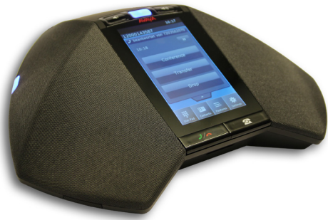
Avaya B189 IP Conference Phone