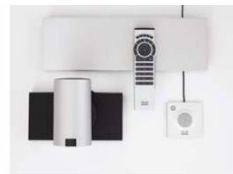
Cisco TelePresence Quick Set C20 includes the Codec C20, Cisco TelePresence PrecisionHD Camera, Cisco TelePresence Precision MIC 20, remote control and cables.

The Cisco TelePresence™ portfolio creates an immersive, in-person experience over the network - empowering you to collaborate with others like never before. Through a powerful combination of technologies and design that allows you and remote participants to feel as if you are all in the same room, the Cisco TelePresence portfolio has the potential to provide great productivity benefits and transform your business. Many organizations are already using it to manage costs, make decisions faster, improve customer intimacy, scale scarce resources, and speed products to market.